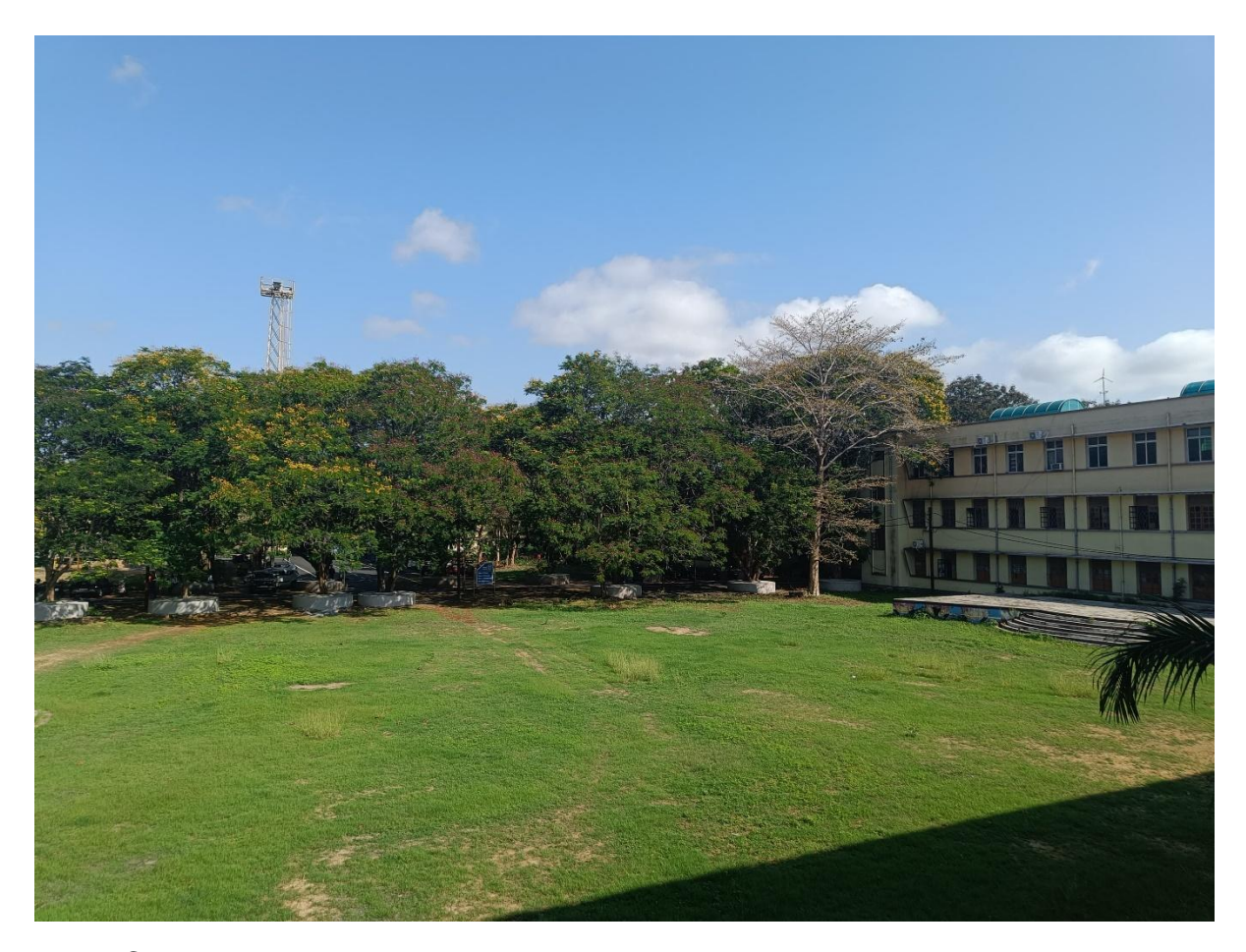
Fig.4. Central open air theatre