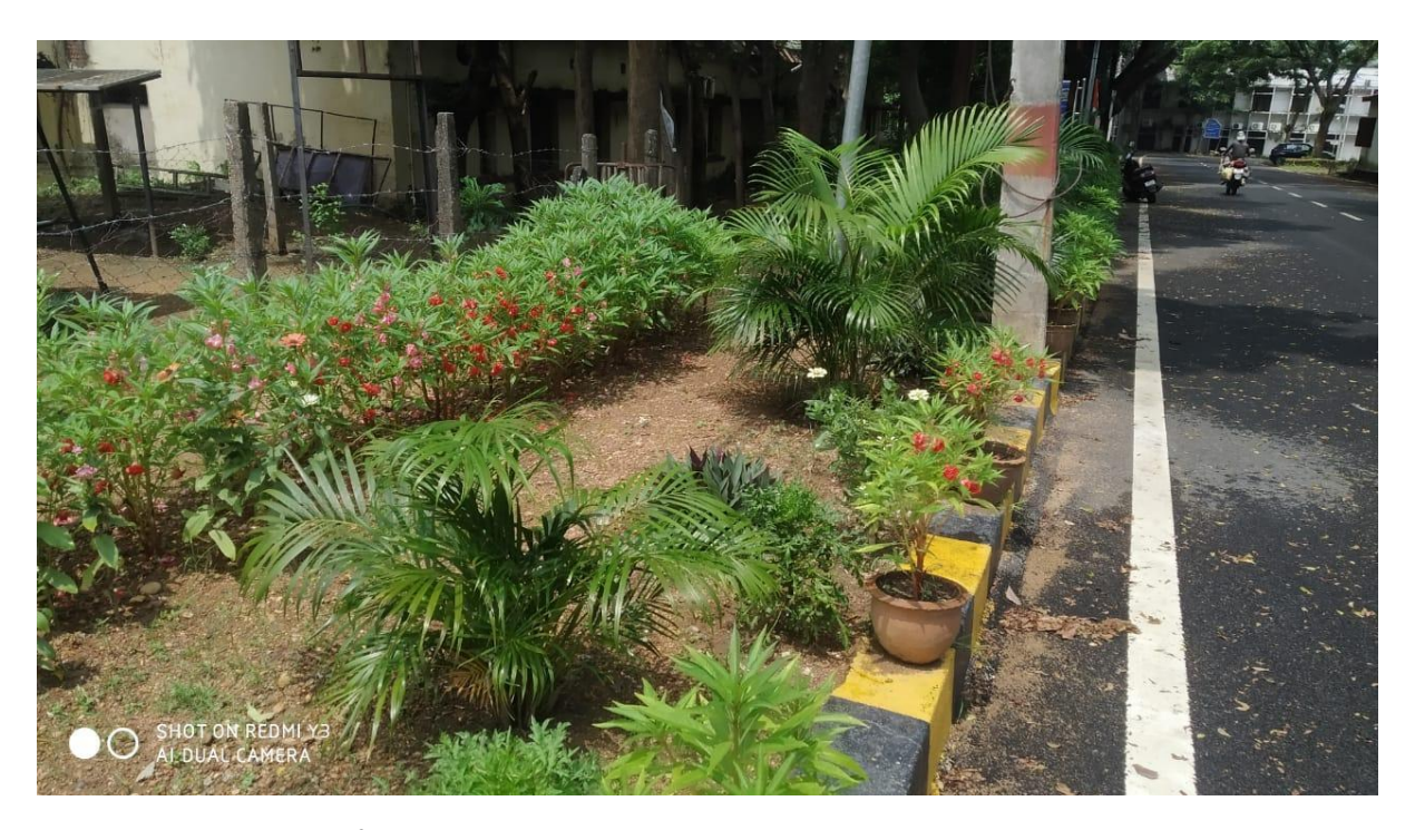
Fig. 10. Plantation of ornamental plants inside campus