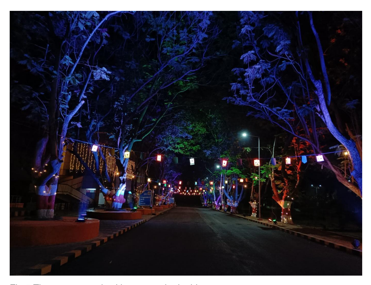
Fig.5 The canteen path with trees on both sides