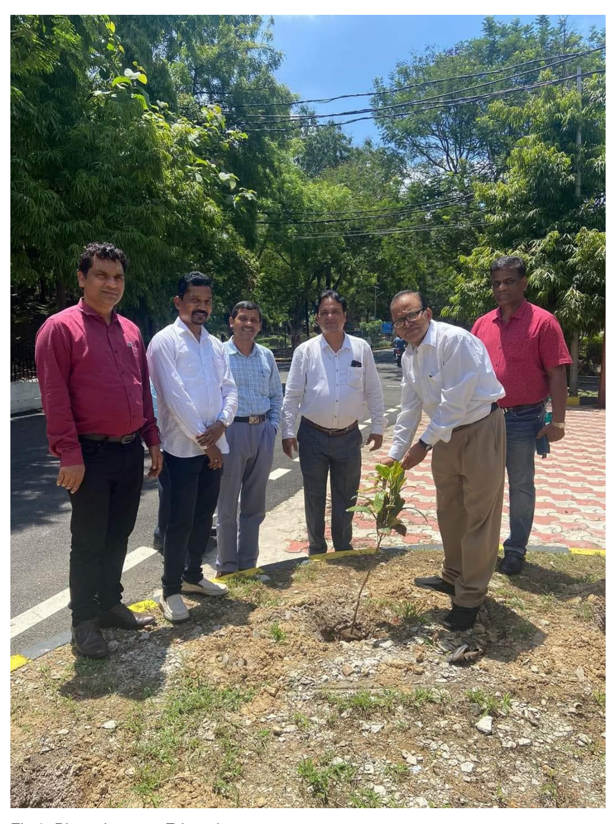
Fig.8. Plantation near E-learning centre