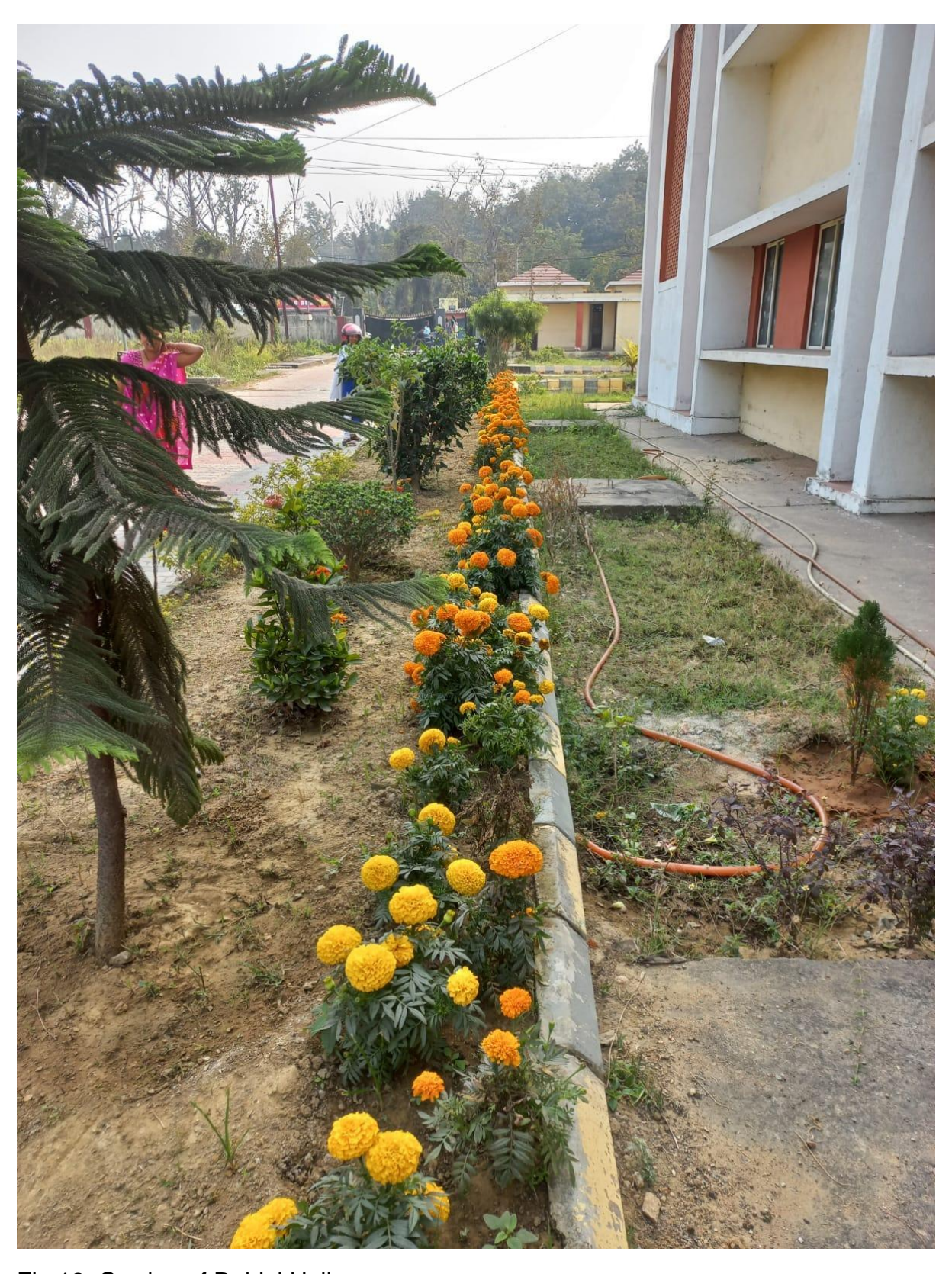
Fig.12. Garden of Rohini Hall