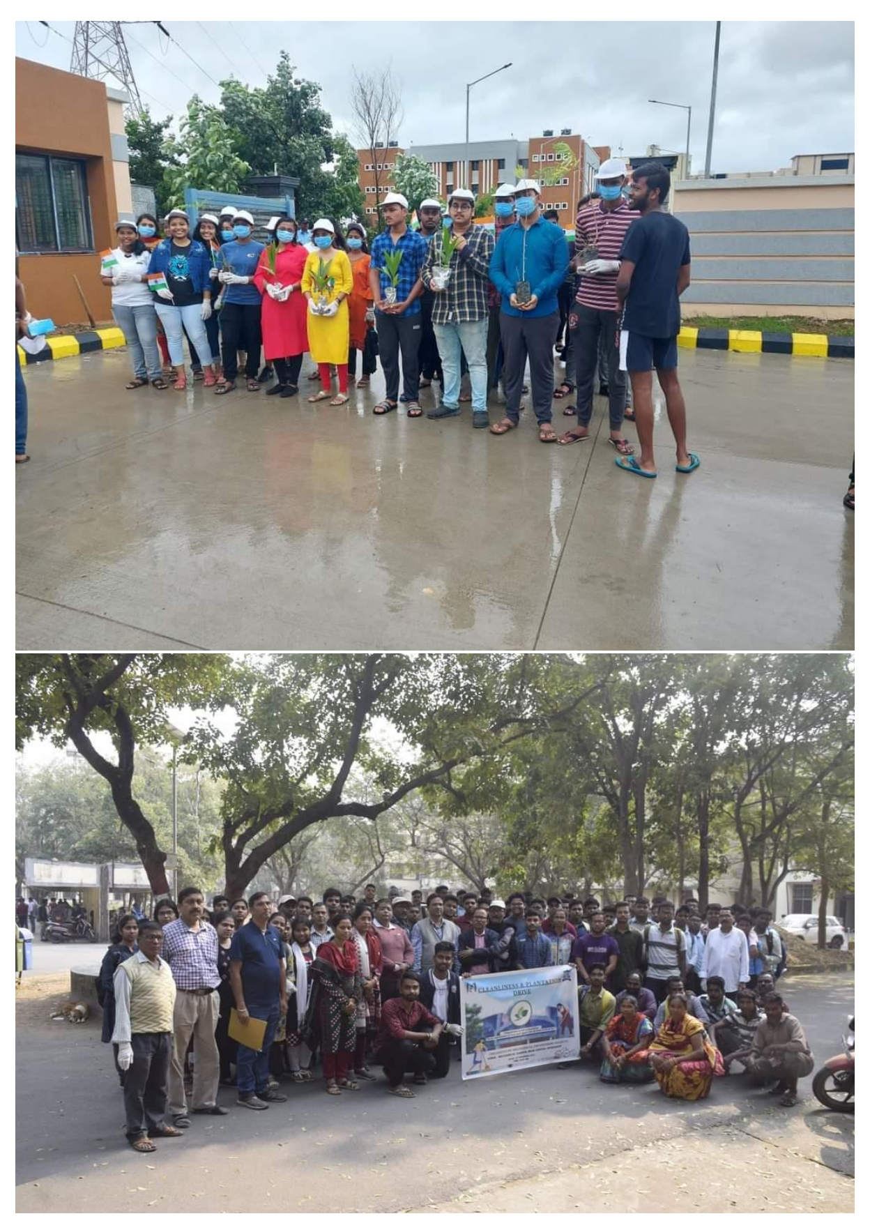
Fig.9. Plantation drive