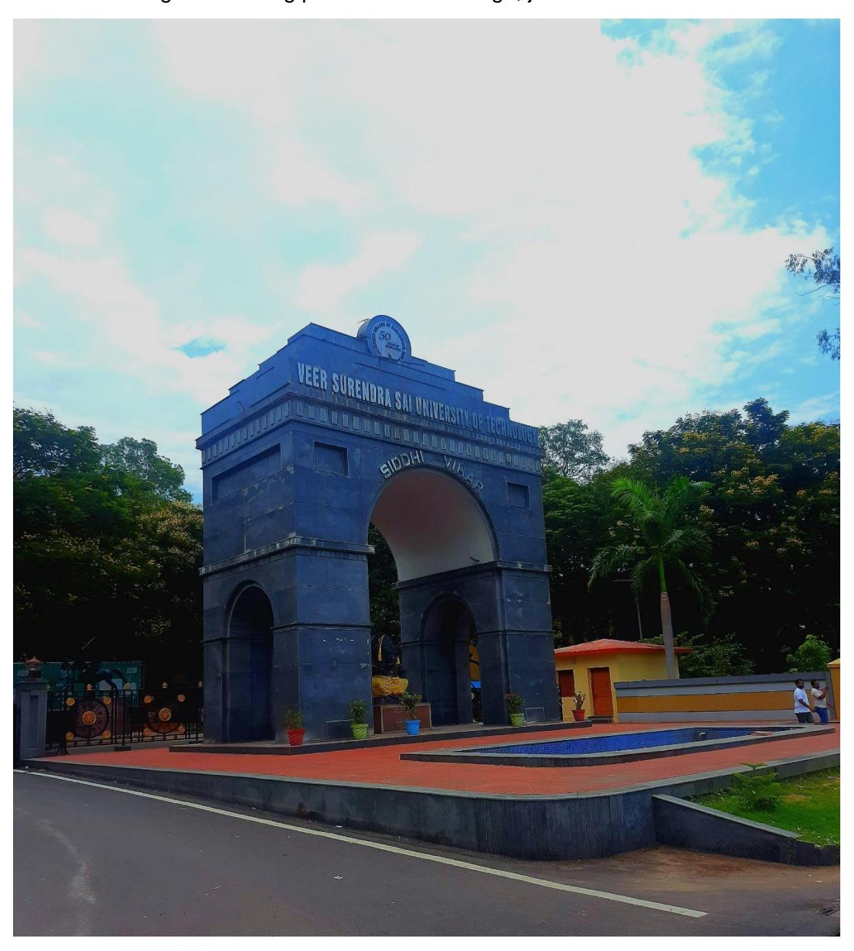
Fig.3. The entrance gate of the University

academic blocks are covered with trees on their sides. The faculty quarters are also covered with big fruit-bearing plants such as mango, jack fruit etc.