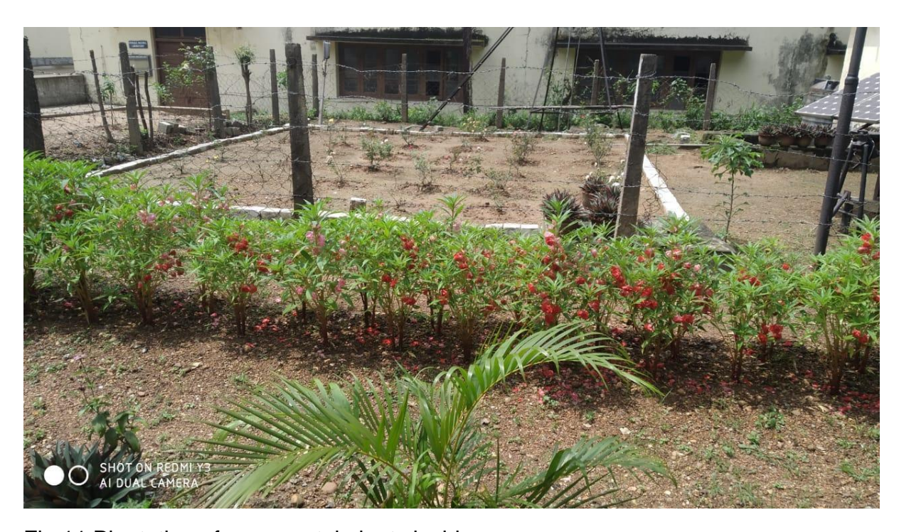
Fig.11 Plantation of ornamental plants inside campus