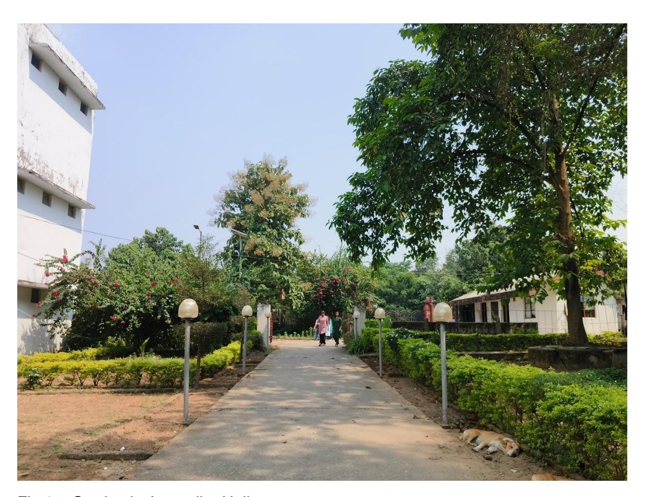
Fig.15. Garden in Anuradha Hall