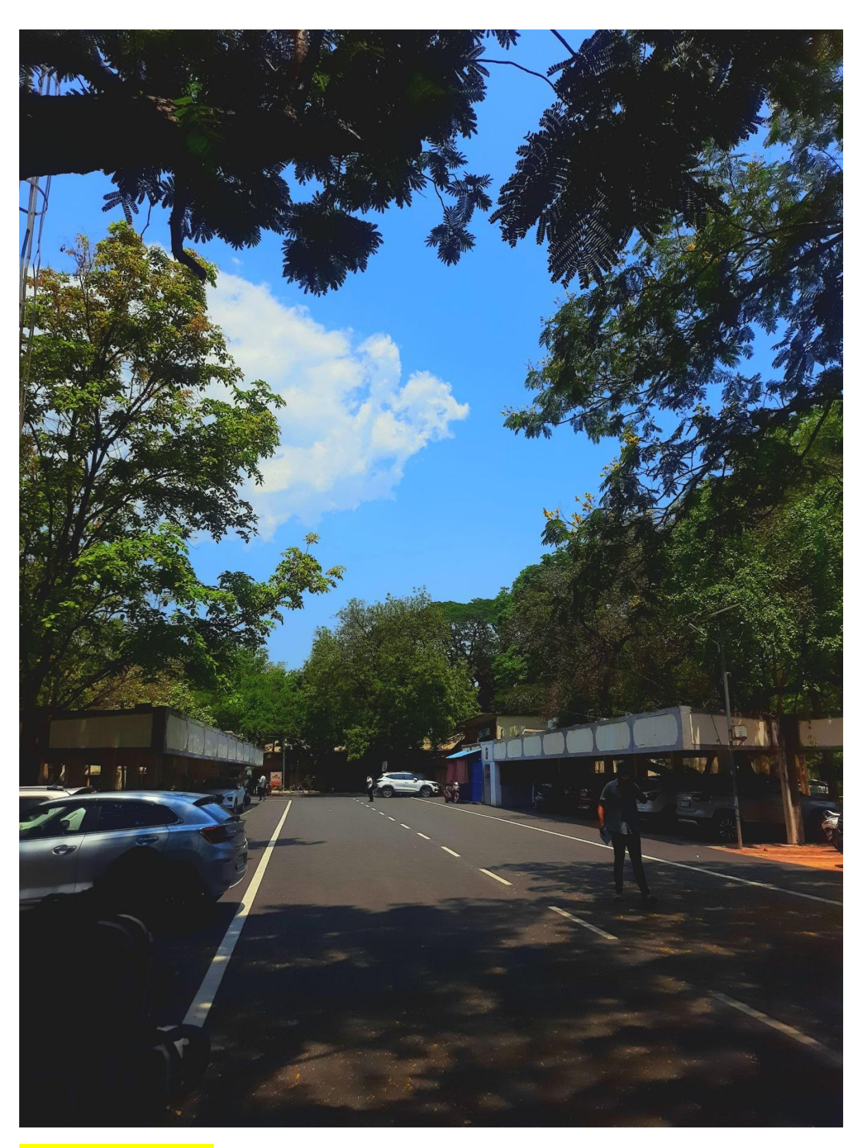
Fig.6 The Caffeteria (Ref landscaping photos and videos)